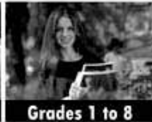
Grades 1 to 8