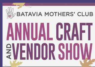
CRAFT & VENDOR SHOW

As we come to the end of a rollercoaster year I would like to thank our dedicated members, loyal sponsors, our understanding families, and our strong community. It took all of us working in harmony to meet the demands of an ever changing crisis. I look forward to a new year of continued harmony as we work to improve the lives of families in our community.