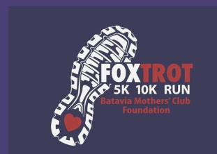
FOX TROT 5K/10K